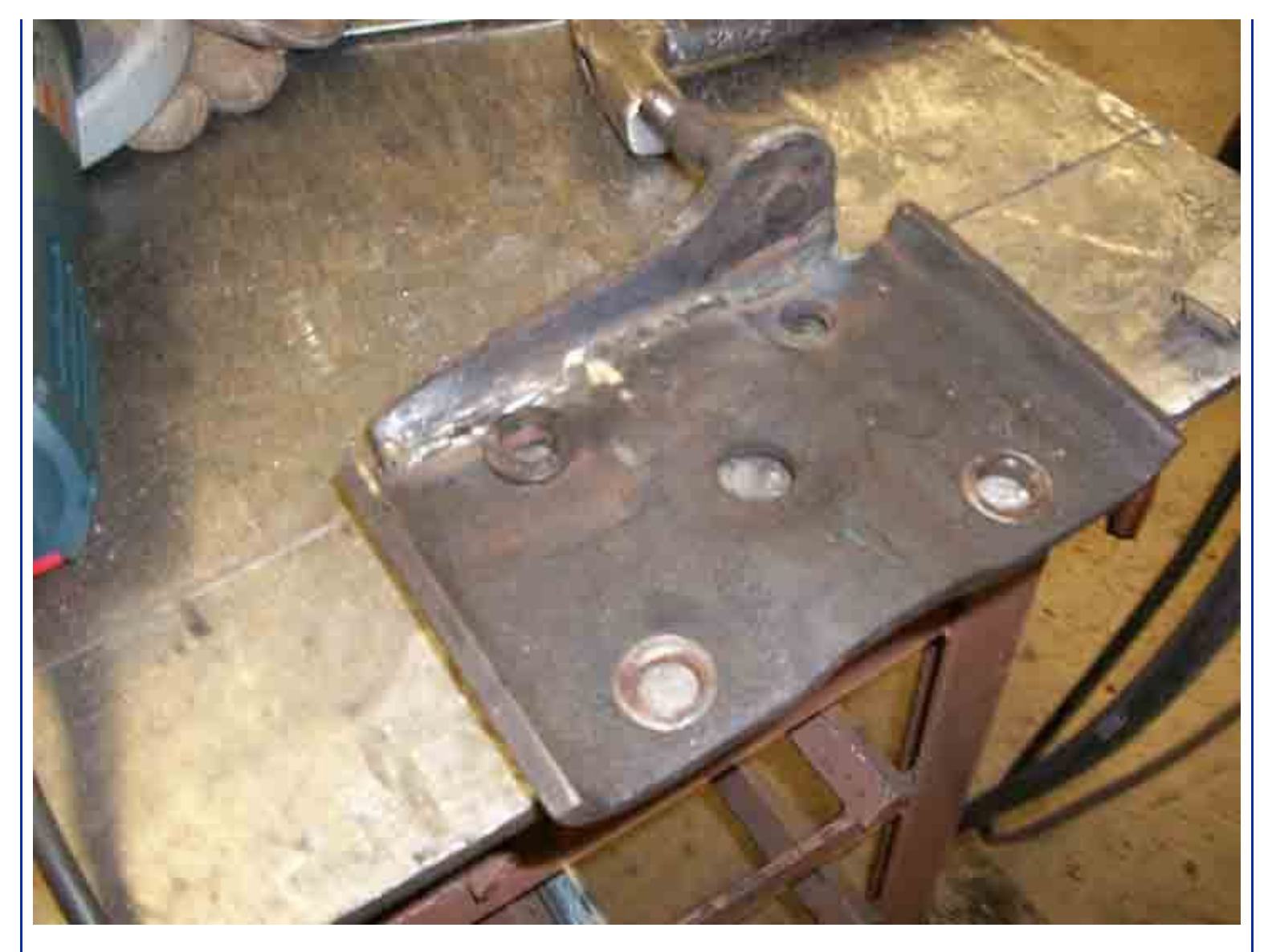
You are done (you can now clean and paint them, or just install them).