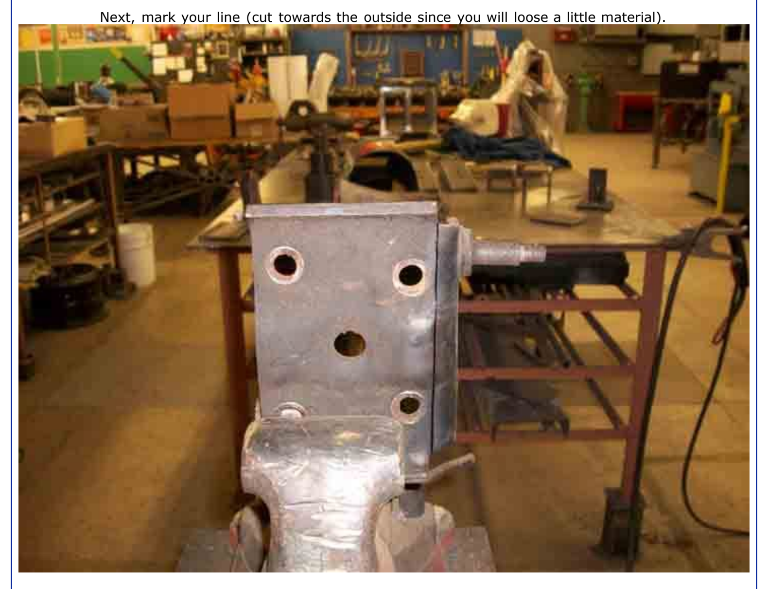
Zip Wheel is your friend (about 1/16" like a cut-off wheel).