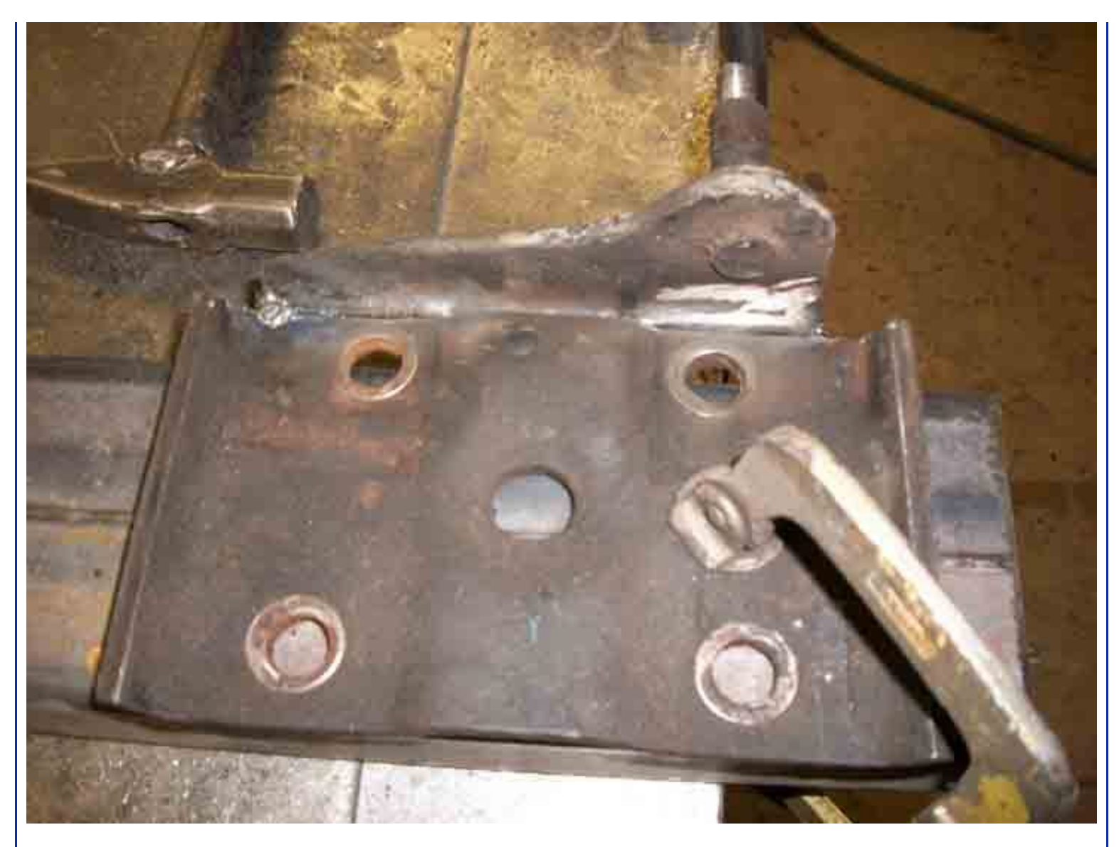
Weld it up on both sides (make sure that the area where the hardened washer sits is flat, grind if needed).